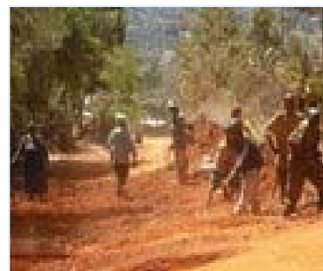
Boys repairing the road – Elizabeth provides food after their day's work

Bee-keeping has been introduced successfully to the village women who combined together and purchased the bee hive, with Elizabeth covering the gap in funds.