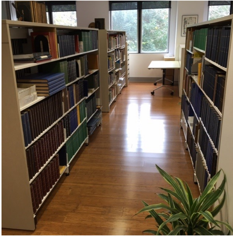
A view of a section of the Library's collection

J. Krishnamurti: 1957 Sri Lanka Talks by J. Krishnamurti